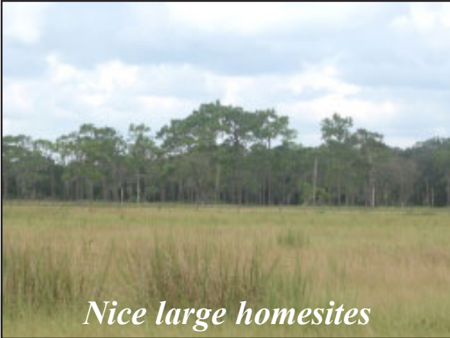
Nice large homesites