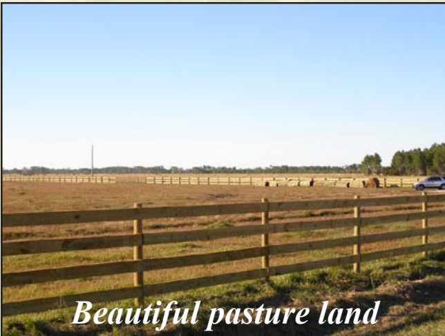
Beautiful pasture land